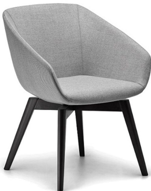
4 Leg Timber Base (Black Stained)