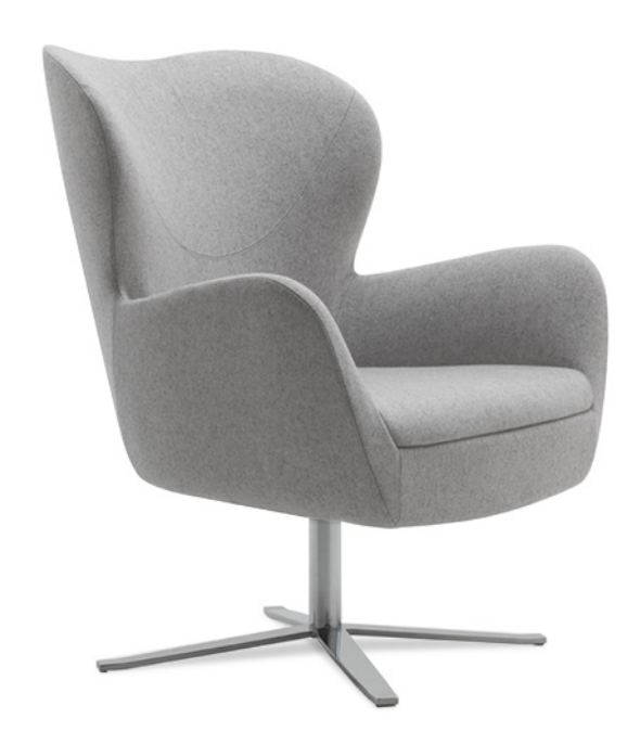
4 Way Swivel base (Chrome)