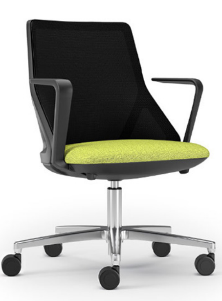
Black frame (MB + armrests + Italian 5 Star base)