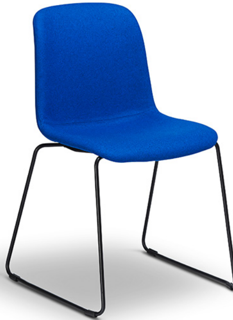
Black sled base + fully upholstered shell