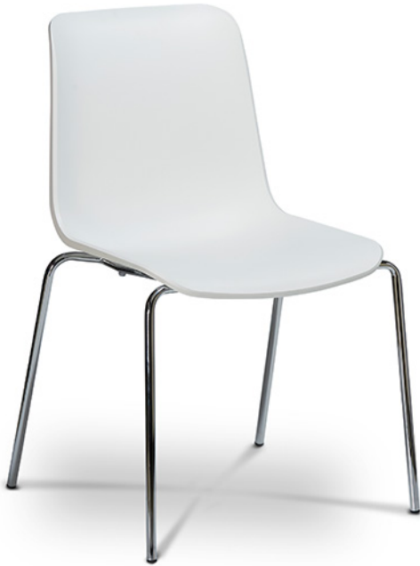
Chrome 4 leg base