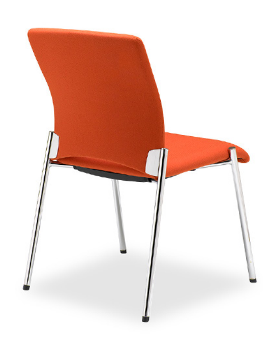
Chrome 4 leg base